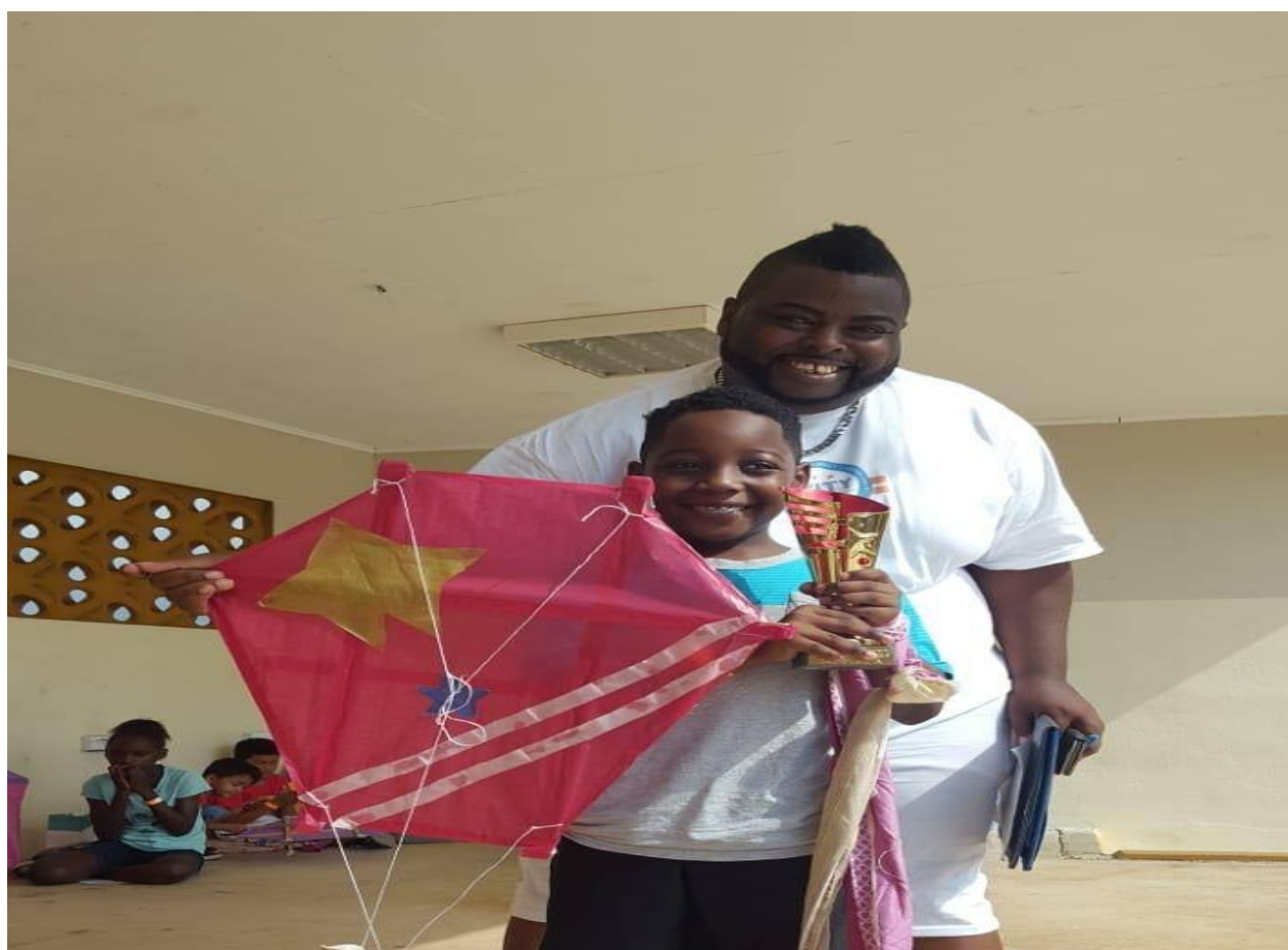
KITE MAKING 2019: 7 th annual kite making class another full house with over 30 kids